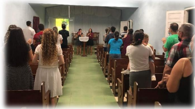
It was great to be in a youth worship service in Viñales.

We are ready to send the next container of medical supplies to our partners in Nigeria. This picture shows the last container recently received. We have started to include Bibles and a variety of other needed items.